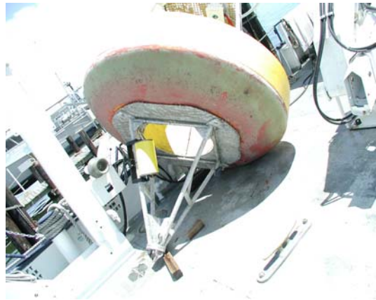
U.S.F. COMPS BUOY