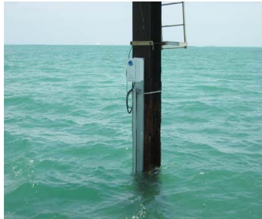
Waterway/Harbor Navigational Marker