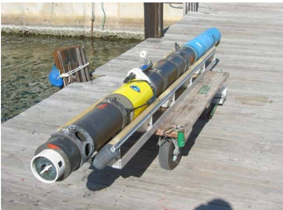
USF BSOP Vertical Profiler