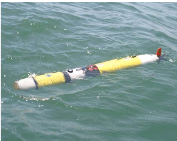
Hydroid REMUS AUV